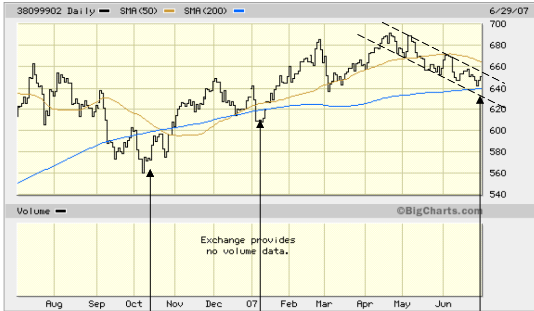
(GC.comex-ccc) Gold,NY - Net Commitments of Traders